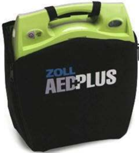
SOFT CASE FOR AED PLUS MSRP: $131.25