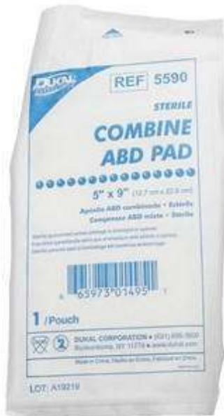
ABD PAD 5 X 9 MSRP: $0.36 EA List Price: $0.33 EA