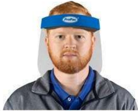
PROTECTIVE FACE SHIELD MSRP:$1.56