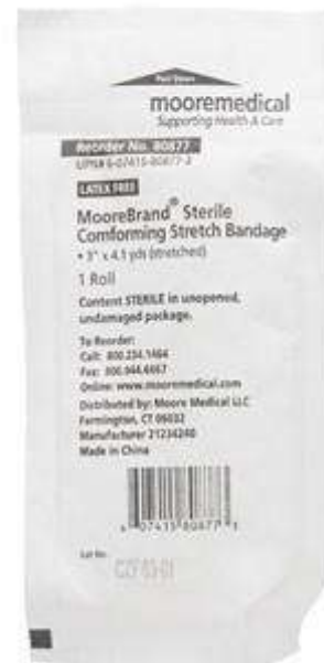
CONFORMING GAUZE 3" X 4YD MSRP: $0.74 EA List Price: $0.66 EA