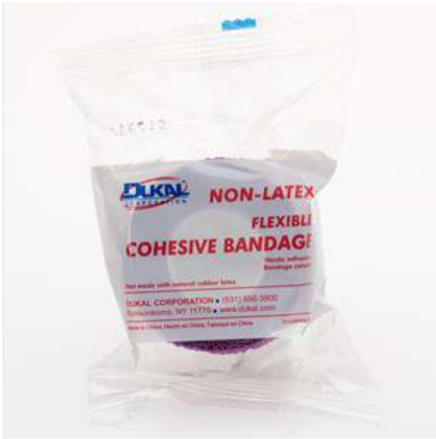
SENSIWRAP 1" x 5 YD MSRP: $1.75