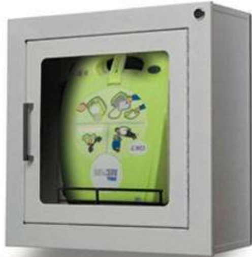
STANDARD METAL WALL CABINET w/ZOLL LOGO