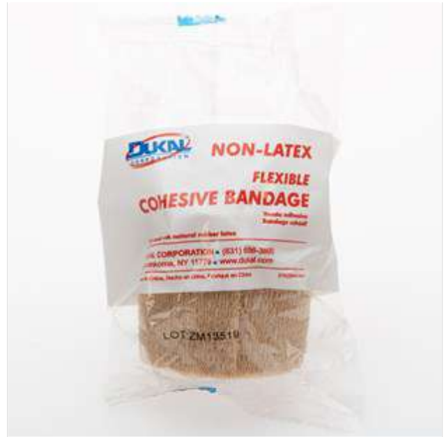
SENSIWRAP 2" x 5 YD MSRP: $1.75