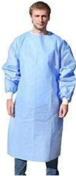
LEVEL 3 SURGICAL GOWN, DISPOSABLE M MSRP:$64.62