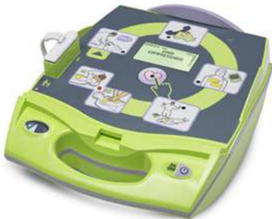
ZOLL AED PLUS