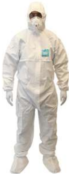
FENTANYL RESPONSE KIT PD